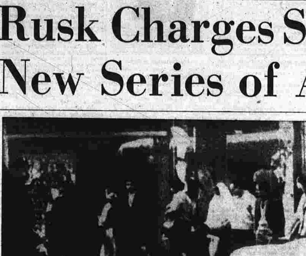
Protesters pass by a Moslem shrine on sidewalk along Mitchell St. in Algiers today as a policeman directs traffic. Man was one of four killed as European gunmen staged terrorist attack against Moslems throughout the city.